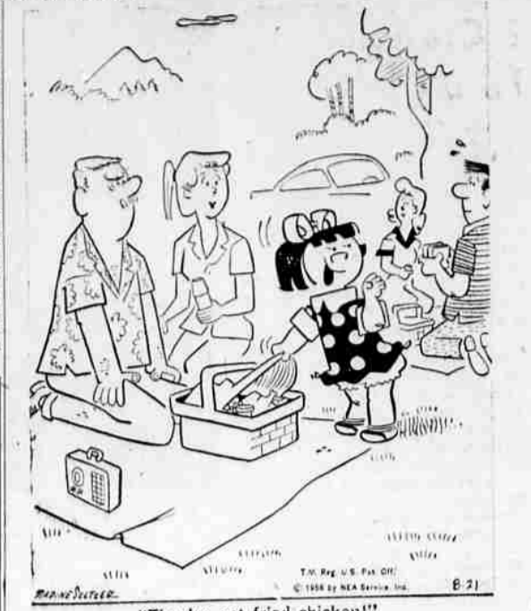
"They've got fried chicken!"