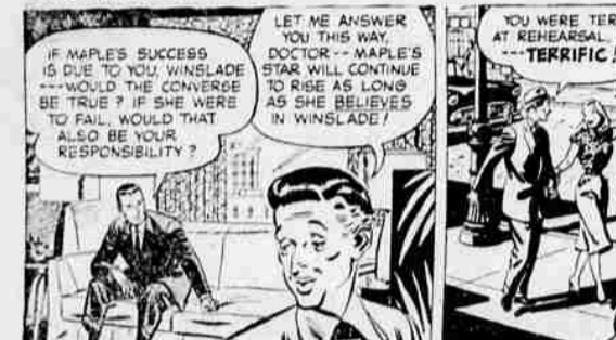
BOOTS & HER BUDDIES