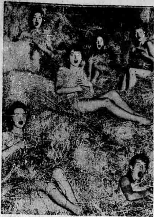
CHICKS IN THE HAY — It's one better than turkey in the straw, as a sextet of California beauties add glamor to a pile of hay. The bevy of barnyard beauties was publicizing a county fair at Santa Rosa, Calif.