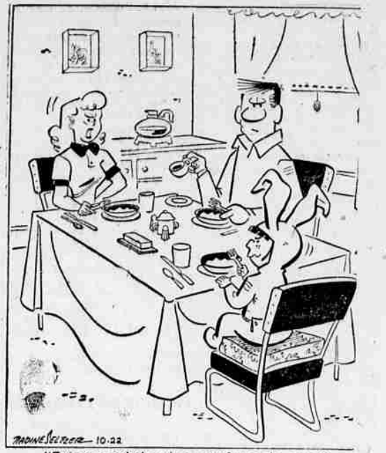
"Eat your salad and stop trying to be cute!"