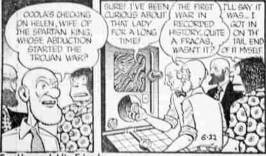
I'LL SAY IT WAS... I GOT IN ON TH' TAIL END OF IT MYSELF