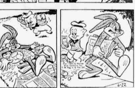
THE FIRST WAR IN RECORDED HISTORY, QUITE A FRACAS, WASN'T IT?