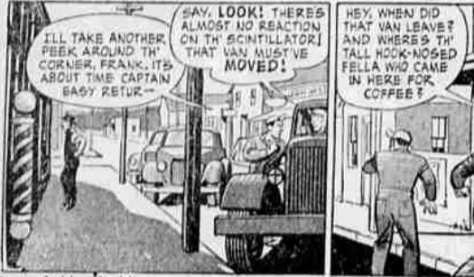
HEY, WHEN DID THAT VAN LEAVE? AND WHERE'S TH' TALL HOOK-NOSED FELLA WHO CAME IN HERE FOR COFFEE?