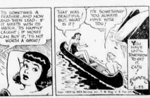
IT'S SOMETIMES A FEATHER, AND NOW AND THEN LEAD-- IF IT KEEPS WITH ITS MATCH, IT'S HAPPILY CAUGHT; IF MONEY CAN BUY IT, IT'S NOT WORTH A GREAT!