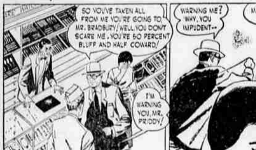
MISS PRODDY, CAN'T YOU PREVAIL UPON--