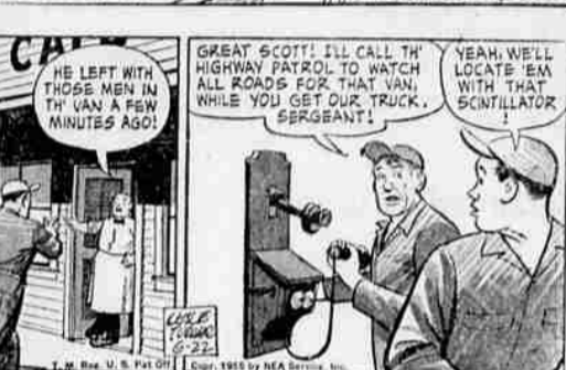
HE LEFT WITH THOSE MEN IN TH' VAN A FEW MINUTES AGO!