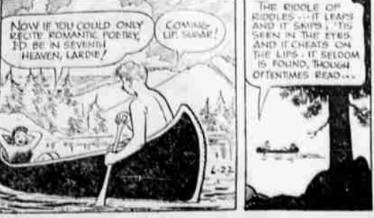
THE RIDDLE OF RIDDLES--IT LEAPS AND IT SKIPS, IT'S SEEN IN THE EYES, AND IT CHEATS ON THE LIPS. IT SLEEDS IS FOUND, THOUGH OFTEN TIMES READ--