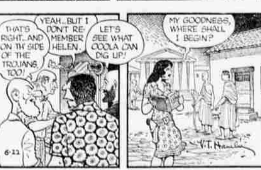
THAT'S RIGHT, AND ON THE SIDE OF THE TROJANS TOO!