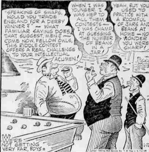
WE'RE GETTING VERY FAR, BOYS