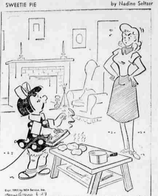
"I'm cooking with the steam iron—we're having steamed potatoes for lunch!"