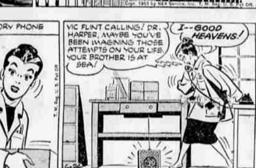
THE LABORATORY PHONE RINGS...