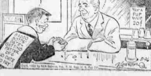
YES, SON, I DO BEFORE YOU TALK WITH YOUR FATHER! HE'S ASKING FOR YOU!