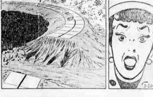
YES, SON, I DO BEFORE YOU TALK WITH YOUR FATHER! HE'S ASKING FOR YOU!