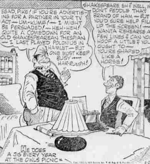
HE DOES A JIG EVERY YEAR AT THE OWLS PICNIC