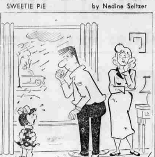
Well, what do I have a raincoat and rubbers for, if I can't go out in the rain?