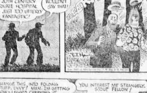
YES, SON, I DO BEFORE YOU TALK WITH YOUR FATHER! HE'S ASKING FOR YOU!