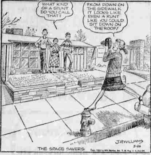
THE SPACE SAVERS