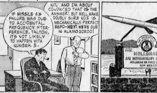
IF MISSILE #5 FAILURE WAS DUE TO ACCIDENTAL FREQUENCY INTERFERENCE, TALTON, IT'S NOT LIKELY TO HAPPEN WITH NUMBER 5.