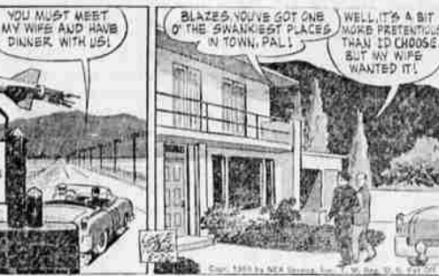
BLAZES YOU'VE GOT ONE OF THE SWANKIEST PLACES IN TOWN, PALL!