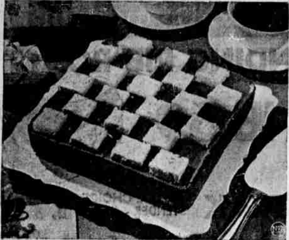
CHOCOLATE ANGEL MOUSSE is a wonderful easy-to-decorate dessert. It's made with semisweet chocolate and store-bought angel cake.