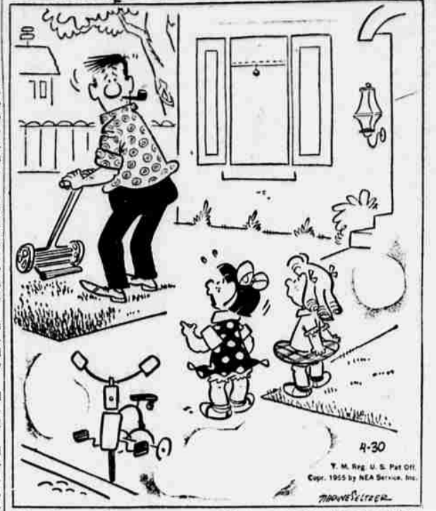
"Don't mow it, pop—we want it to grow so we can make ourselves grass skirts."

The election is tentatively planned May 16 at the Metolius grade school, from 2 to 8 p.m. Purpose of the issue is to obtain funds to construct a four room addition to the existing school and to install a complete heating plant for the entire building.