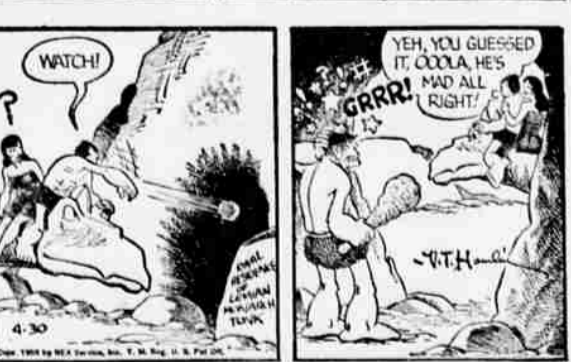
Freckles and His Friends