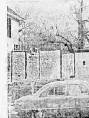
CUTS HIMSELF A SLICE OF HOUSE —The contractor who took on the job of moving this Manhattan, Kan., house to a new location found that the structure was too tall to take through the city's streets. So he made it a layer-cake operation by sawing the house into two layers for trucking away. The site was needed for a nearby bank's parking lot.