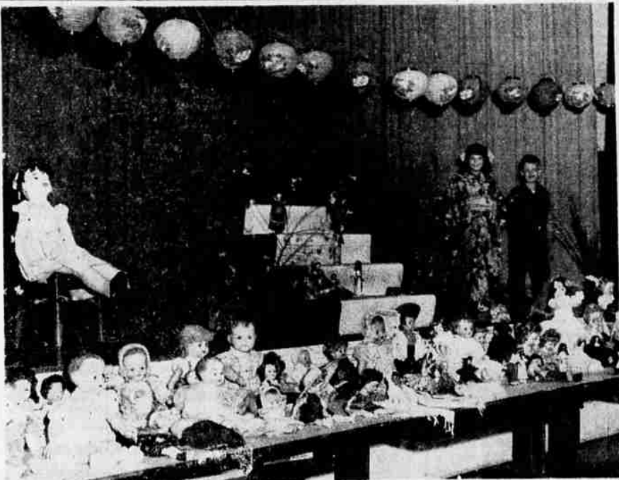
IT'S A JAPANESE CUSTOM — Children at Thompson school Thursday joined hands with youngsters across the sea.

Crop control and government aid to farmers aren't entirely new. A minimum price was set on tobacco in 1631.