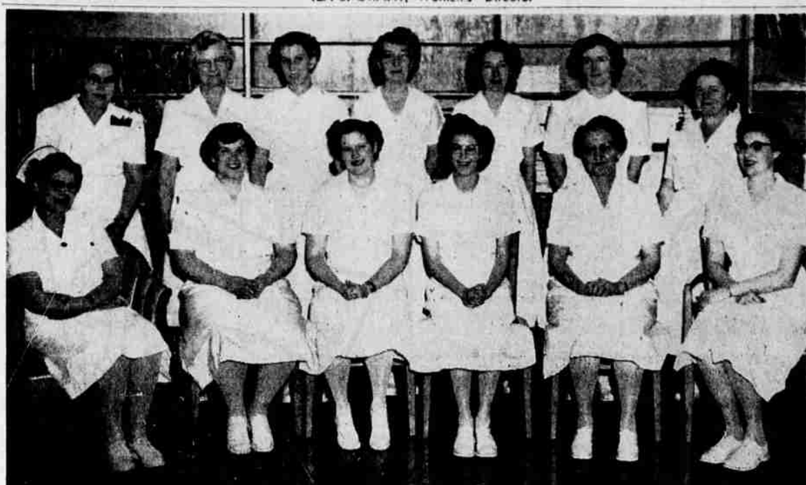
IN TRAINING CLASS — Students in the new Central Oregon College practical nursing class have started the second month of their year-long course.