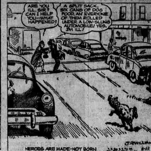
ARE YOU ILL, SIR? CAN I HELP YOU — WHAT HAPPENED?