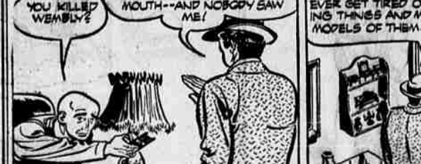
YOU KILLED WEEMBYE!