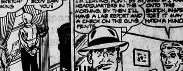
WELL, NOTHING RIGHT NOW... JUST WANTED YOU STANDIN' BY IN CASE...