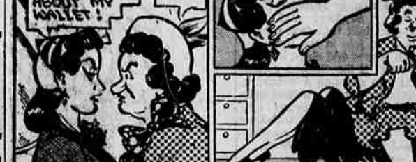
HEL P P — YOU CAN START TALKIN' JUS' ANYTIME, MA'AM "OF YOUR OWN FREE WILL," A COURSE!