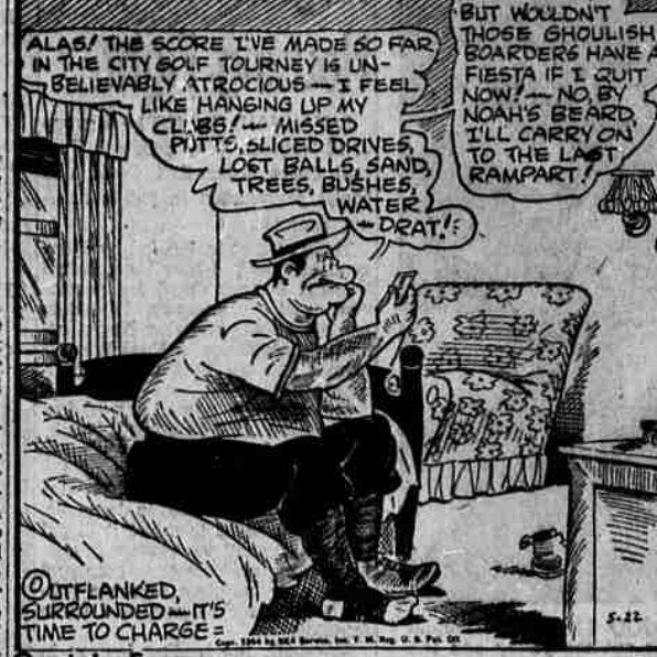
ALAS! THE SCORE I'VE MADE SO FAR IN THE CITY GOLF TOURNEY IS UNBELIEVABLY ATROCIOUS — I FEEL LIKE HANGING UP MY CLUBS! — MISSED PUTTS, LOST BALLS, SAND, TREES, BUSHES, WATER — DEAT!