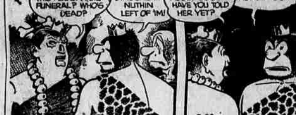
HE'S OOP! HE'S GONE, PLUMB UP BY HIS DINOSAUR... NOTHING LEFT OF HIM!