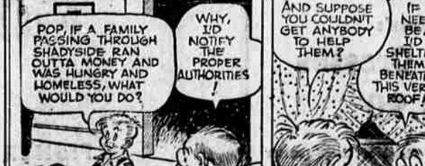
AND SUPPOSE YOU COULDN'T GET ANYBODY TO HELP THEM? (IF NEED BE, I'D SHELTER THEM BENEATH THIS VERY ROOF!)