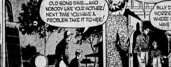
YOU'RE HOME NOW, BILLY! THERE'S NO PLACE LIKE IT, AS THE OLD SONG SAYS... AND NOBODY LIKE YOUR MOTHER! NEXT TIME YOU HAVE A PROBLEM TAKE IT TO HER!