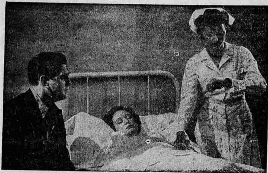
HOSPITAL BOARD and ROOM