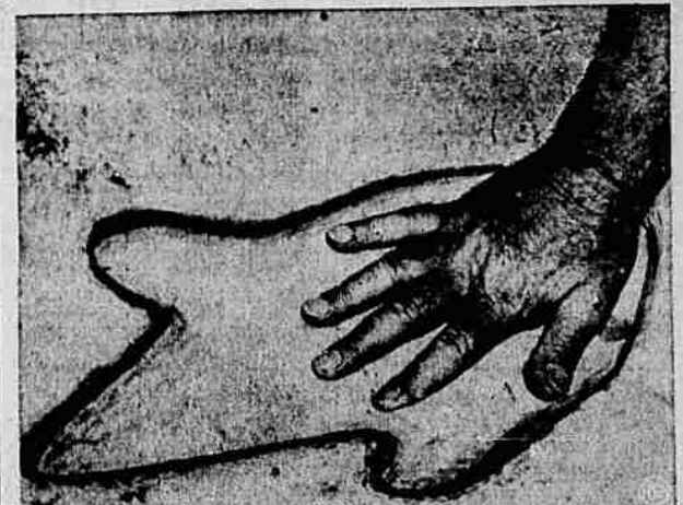
ON THE SANDS OF TIME —Recently discovered in the rocky hill country along the Guadalupe River near Kerrville, Tex., were huge dinosaur tracks like that pictured above, dwarfing a man's hand. It was made, some millions of years ago, by a monster called Tyrannosaurus Rex, fiercest and most terrible of the prehistoric animals. From 40 to 50 feet long and 18 feet high, it was a carnivorous killer with a melon-shaped head that was mostly mouth and sharp teeth. As seen in sketch, below, it walked erect, supported by its huge alligator-like tail and used its comparatively small and weak forelegs for grasping its prey.