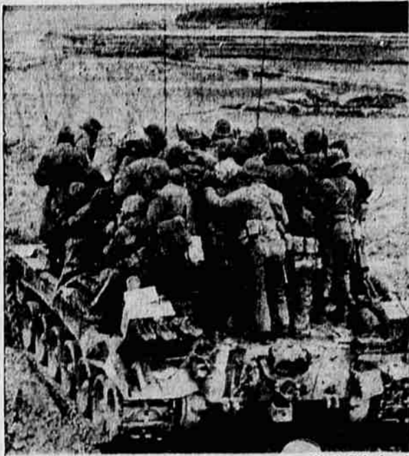
MUST BE COMMUTERS —These Marines crowd aboard an M-26 tank like commuters during the rush hour as they move forward for another assault on the enemy after securing an important hill somewhere in Korea.