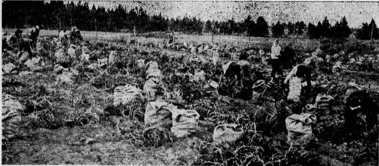
One of the high producing potato fields in the Bend area was that of Frank and Bertil Nelson, near the Butler road. The yield was in excess of 500 bushels to the acre. Here is a busy corner of the field, with pickers at work. Warm Springs Indians joined in the harvest of the big tubers.