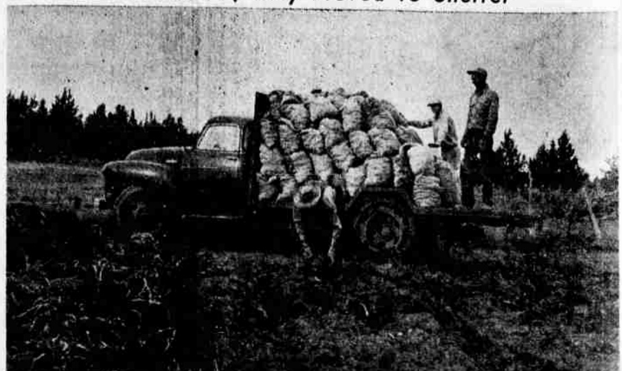
With late October weather always carrying a danger of frost, potato growers do not take any chances in leaving tubers in field overnight. Here is a truck being loaded with half sacks on the Nelson Bros. farm, east of Bend as evening comes to the Deschutes country. Wet weather also caused some picking trouble.