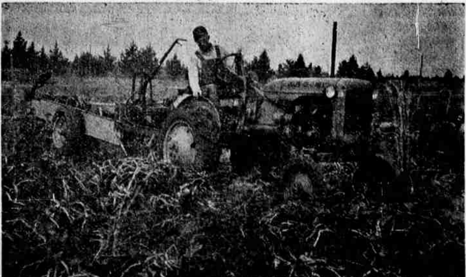
This surely is a vast improvement over the old style potato digger, a shovel powered by man. In one sweep across the field, this outfit can uncover more potatoes than a crew of men working with shovels a full day. Bertil Nelson is at the controls of this motorized potato digger.