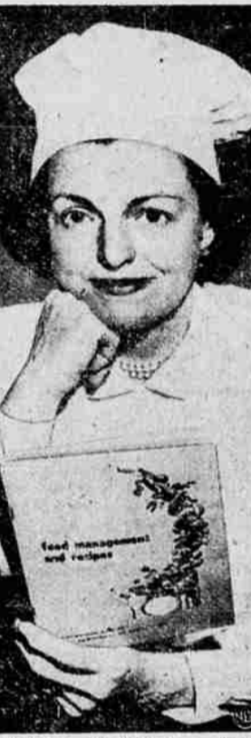
WHO'S COOKIN'? — Rep. Helen Gahagan Douglas (D., Calif.) donned a chef's cap to look through one of the cook-books printed by the government for free distribution. Each member of Congress has 3000 of the books to give to constituents.