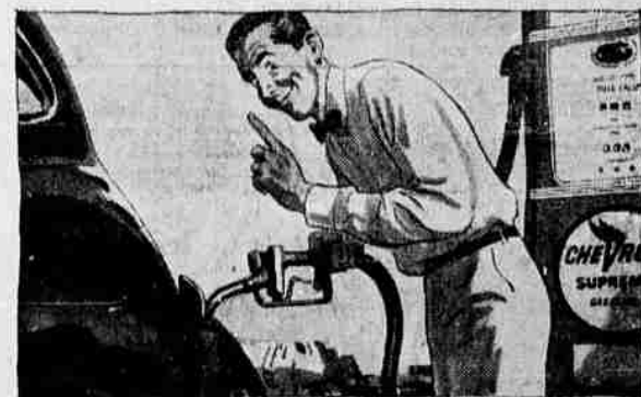
...When you can use Chevron Supreme. It's clean and Super-refined!