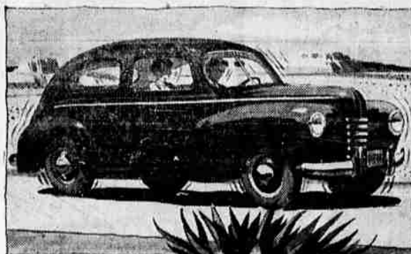
Why let gummy gas steal fun and power, make your car feel like this?

The gasoline that's Super-refined to remove power-robbing gum!