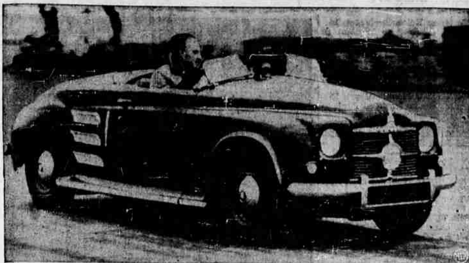
BRITISH JET CAR MAKES TEST RUN —The British auto industry's first jet-propelled car makes a test run at Silverstone, England. The car, powered by a pair of twin kerosene-fed jet turbines, traveled 90 miles an hour during the test.

It warned that failure to punish the union would hamstring future court efforts to halt strikes affecting the national safety.