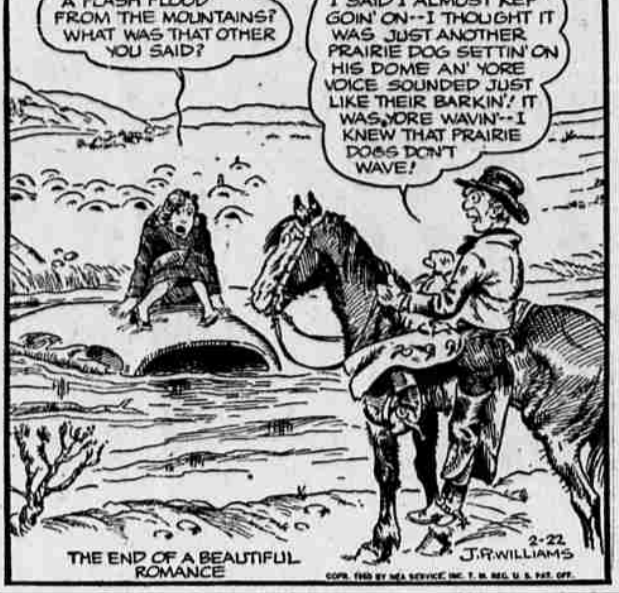
THE END OF A BEAUTIFUL ROMANCE