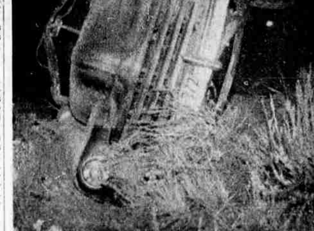
Rodney Butterfield, 21, Prineville, suffered slight injuries about 10 p.m. last night when his car, pictured here, skidded from the ice-frosted Ochoco highway a short distance east of Redmond. Butterfield was to be released from the hospital today.

Rodney Butterfield, 21, Prineville, suffered slight injuries about 10 p.m. last night when his car, pictured here, skidded from the ice-frosted Ochoco highway a short distance east of Redmond. Butterfield was to be released from the hospital today.