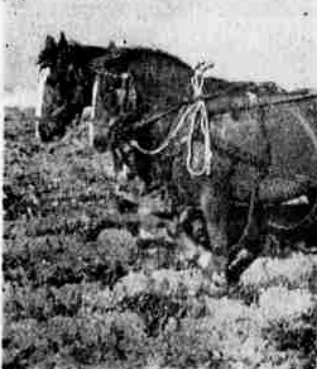
Horse power, of the team type, still has a place in the harvest of Central Oregon potatoes, a visit to the Louis Ellington ranch just east of Bend has revealed. Pictured here is a well-matched team drawing a potato digger. Aboard the digger is D. L. Ellington. Motorized equipment is being used generally this fall in the harvest of the region's biggest potato acreage.