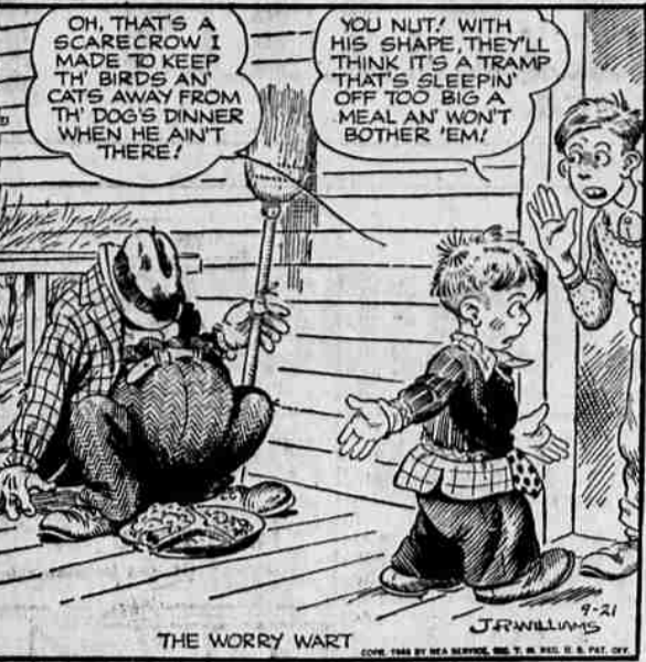
THE WORRY WART