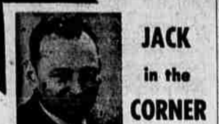
JACK in the CORNER