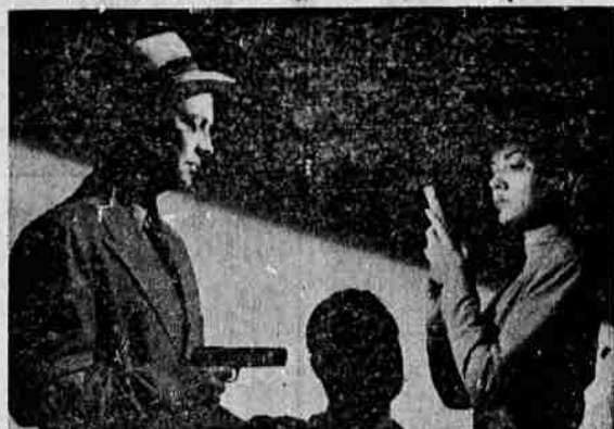
ROBERT TAYLOR and AUDREY TOTTER grill a murder suspect. A scene from MGM's "HIGH WALL," co-starring HERBERT MARSHALL.