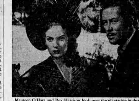
Maureen O'Hara and Rex Harrison look over the plantation in this scene from 'The Foxes of Harrow,' a 20th Century-Fox picture.