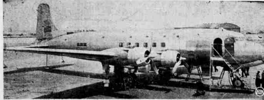
"The Independence," new presidential plane, a DC-6 transport, was unveiled for photographers in Santa Monica, Calif. The three rear windows are placed in area of conference room which can be made into a private stateroom. Windows over wings are cut in the general passenger space. When painting of the plane is completed a stylized eagle head will cover the nose. With a cruising speed of 315 miles an hour, the executive transport rates an absolute range of 4400 miles.