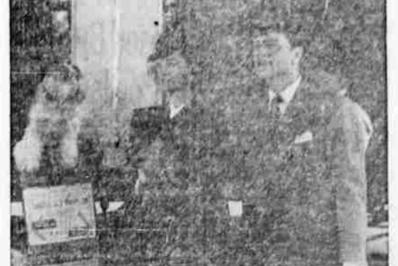
Together again for the first time in two years are William Powell and Myrna Loy in "The Thin Man Goes Home," with Lucile Watson.