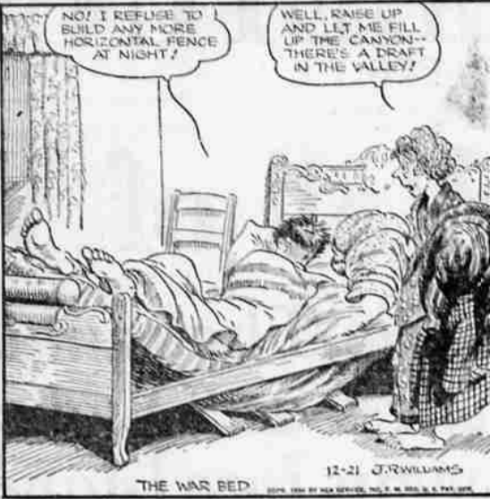
THE WAR BED

loes providing the opposition. Last night's lineup: