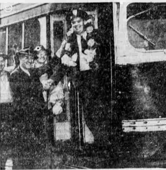
Instead of the usual boos for going through picket lines,aretcar motor-men were cheered by all when cars started to run again in Pittsburgh, Pa., after three-week strike. Here, the first one out of the barns is presented with floral bouquets.