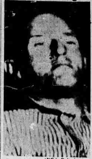
William Joyce, the Lord Haw Haw of German radio, pictured in ambulance after arrest as traitor by British near Plensburg, Germany. He was wounded by one of arresting officers when he moved as if to draw a gun.

would gain rather than lose by the proposed one year's training.