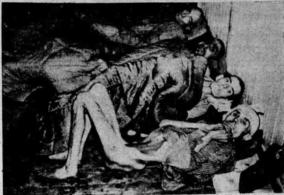
These starved and maltreated prisoners at the concentration camp in Buchenwald, Germany, now are getting good care from their American liberators. But some, past all help, will die.