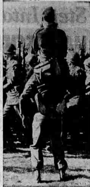
With the aid of a helpful soldier's shoulders, this Signal Corps photographer makes some high-angle shots of the 101st Airborne division as it marched in review during presentation of Presidential Unit Citation for its heroic defense of Bastogne.