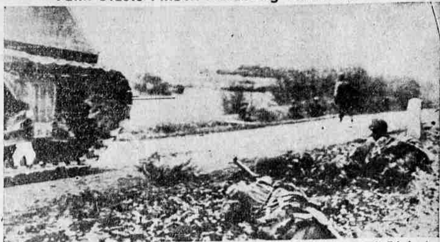
Infantrymen of Tenth Armored Division take cover along road as tank trains gun on Nazi pillbox holding up Third Army's rush against the last 30-odd miles of the Rhine's west bank held by the Germans between Ludwigshafen and Karlsruhe corner.