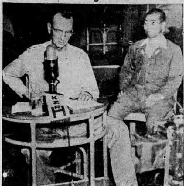
When there was no further hope, all ammunition exhausted, Lt. Gen. Jonathan Wainwright broadcast surrender orders to his troops from Manila radio station under watchful eye of Japanese guard. This picture was taken from Japanese by Filipino guerrillas, released by U. S. Army Signal Corps.