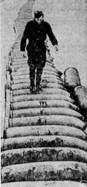
When heavy rains and melting snow flooded an airfield in eastern Italy, the flyers made a bridge of 1000-pound bombs. Above, apparently unperturbed that death is beneath every step, an RAF airman strolls along the novel causeway.