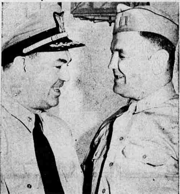
Comdr. Jack Dempsey, USCG, and Captain James Braddock, USA, both one-time holders of the world's heavyweight title, meet again in the Hawaiian Islands. Braddock is stationed with the Army Transportation Corps, Dempsey is on tour of Pacific bases. Both are directors of recreation and physical education programs of their respective services.