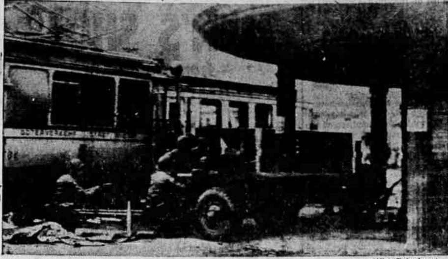
An American 57-mm. anti-tank gun uses the main trolley stop in Rbedyt, Germany, home town of Dr. Joseph Goebbels, Nazi propaganda minister, to cover advance of Yanks pushing through town.