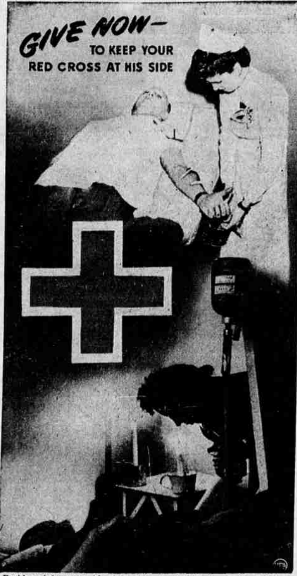
Besides giving your blood to aid wounded Yanks on the fighting fronts, you can reach your hand across the world just by putting it in your pocket and giving your share to the 1945 Red Cross War Fund.

GIVE NOW— TO KEEP YOUR RED CROSS AT HIS SIDE