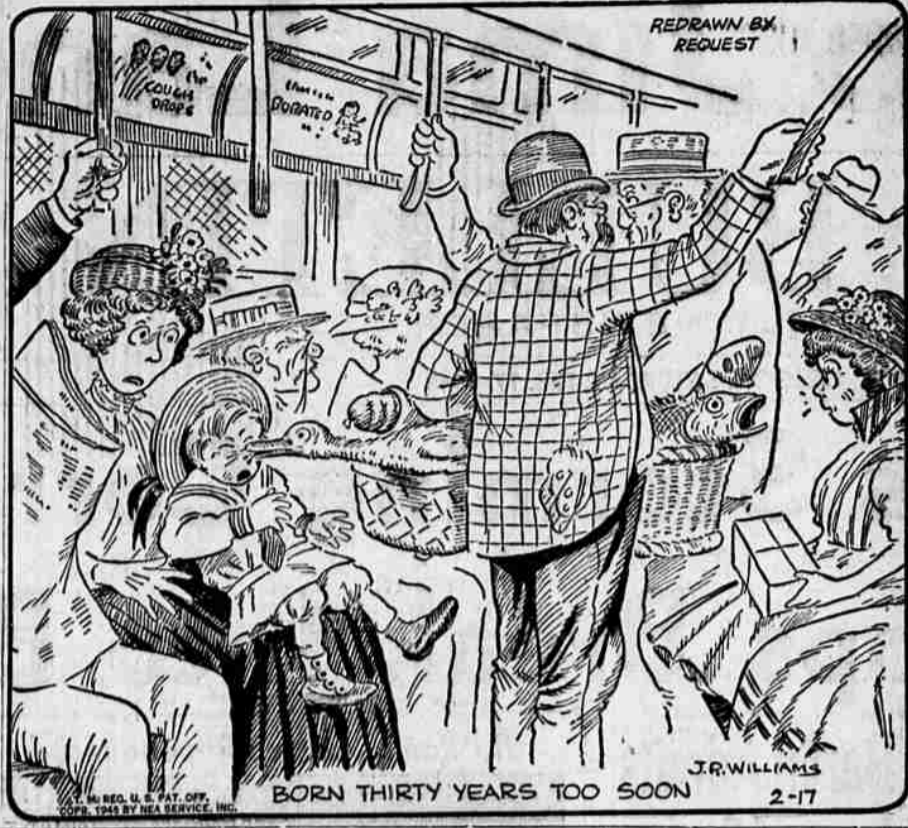
BORN THIRTY YEARS TOO SOON 2-17