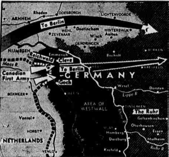
From Holland to the Alps, General Dwight D. Eisenhower is hurrying American, British and French troops into the climactic battle of Germany. In spectacular phase of the big Allied push, the Canadian First Army gained five miles on six-mile front in smash intended to carry around northern end of Siegfried Line toward Ruhr and Berlin.