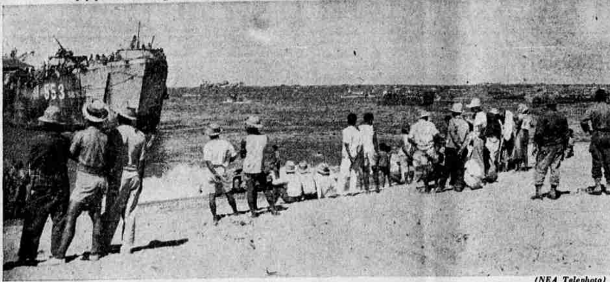
Filipino natives turn out in their ceremonial whites to welcome doughboys streaming ashore in bloodless landing at La Paz, on west coast of Luzon, to cut Jap lines between Bataan and other Jap-held parts of Luzon. Not a shot was fired nor a bomb dropped throughout the landing.