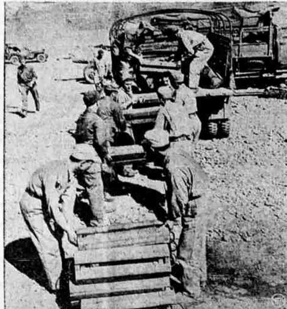
American and Chinese soldiers are shown piling ammunition into one of the convoy trucks at Ledo, India, for movement to the Chinese fighting front over the newly-opened Burma-Ledo highway. The highway has been named Stilwell Road after Gen. Joseph W. Stilwell.