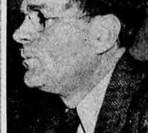
Aubrey Williams, above, 54-year-old Alabamian who formerly headed the defunct National Youth Administration, has been nominated by President Roosevelt as head of the Rural Electrification Administration.

It was immensely interesting to have been in on the planning of that operation, and to have been in England during the February and March air raids. In fact, the whole thing was quite fascinating and terrible at the same time.