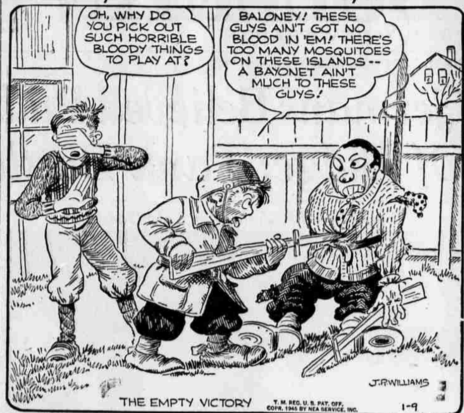
THE EMPTY VICTORY T.M. REG. U.S. PAT. OFF. 1-9