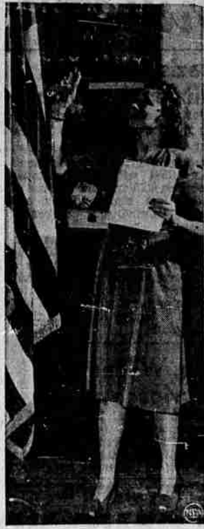
Ellen Schwanneke, 29-year-old actress who once snubbed Hitler, is shown above swearing allegiance to the U. S. as she became an American citizen in New York City. She made her great hit in "Maedchen in Uniform" and was the toast of Berlin. Adolf Hitler sent her gold-embossed invitations, but she turned them down.