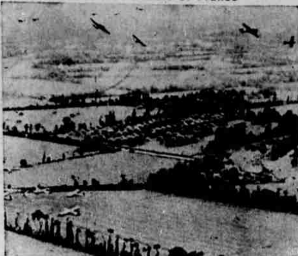
Tow planes and gliders of the 9th USAAF circle fields on Cherbourg peninsula for landing. Of a number already landed, some did so safely, others crashed, with casualties.