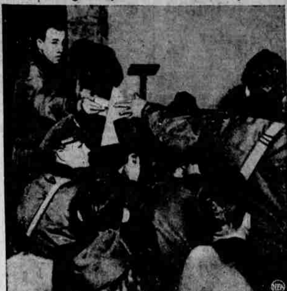
It's "Colonel Jimmy" now, for Maj. James Stewart, former screen star, has been promoted to the rank of lieutenant colonel. Serving as operations officer for an 8th USAAF B-24 bomber group, he has flown 14 combat missions, holds Distinguished Flying Cross and Air Medal with oak leaf cluster. He's pictured, left, above, at his group's English base, distributing flight forms to pilots before they take off to participate in invasion of France.

power in his home state and comes to Chicago as chairman of the Kansas delegation.