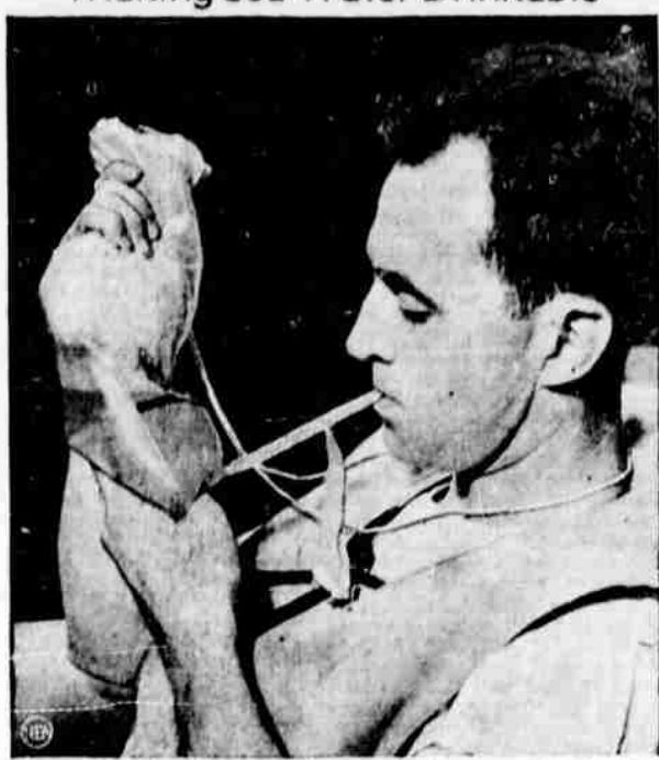
Purifying device demonstrated here by sailor converts salt water into drinking water—a boon to seamen and flyers adrift at sea. Water is put in top part of bag and squeezed through chemicals that filter it. All life rafts will carry this equipment.