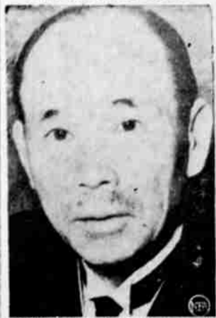
Foreign minister of the new strongly nationalistic Japanese cabinet is Admiral Teijiro Toyoda, above, who was vice minister of the Navy in the displaced cabinet. He succeeds Yosuke Matsuoka, who signed a military alliance with Germany and Italy and a non-aggression pact with Russia.