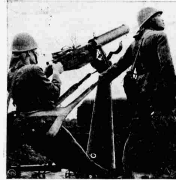
Dutch Indies anti-aircraft gunners.

No soft touch are the defenders of the rich Netherlands East Indies. As Japan threatened further aggression in the South Pacific, these pictures arrived in the United States. And the above planes and guns are not just showpieces. Military observers believe the Dutch are ready for a real fight this time.