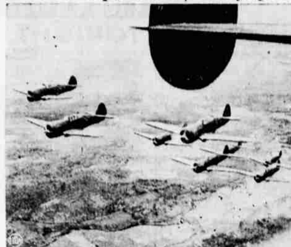
Dutch fighter planes over Java.