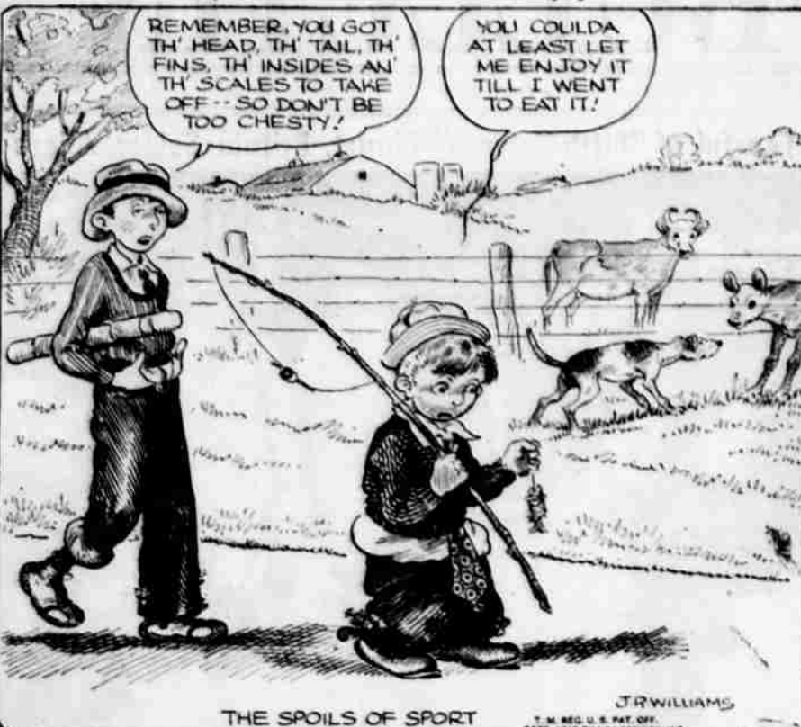
THE SPOILS OF SPORT