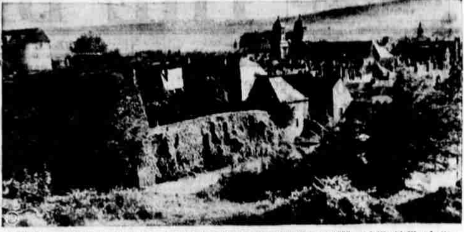
Already a crucial point in two great wars, the Franco-Prussian War of 1870, and World War I, the small French village of Sedan, pictured above, 10 miles from the Belgian border, may be scene of a decisive "great battle of the west" in present war.