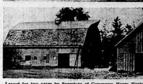
Leased for two years by Secretary of Commerce Harry Hopkins, this 388-acre farm near Grinnell, Ia., is location where Hopkins returns to agriculture, establishes legal residence in tall corn state. It adjoins farm where Hopkins worked as farmhand during boyhood. Top, the residence. Lower, two of the barns.