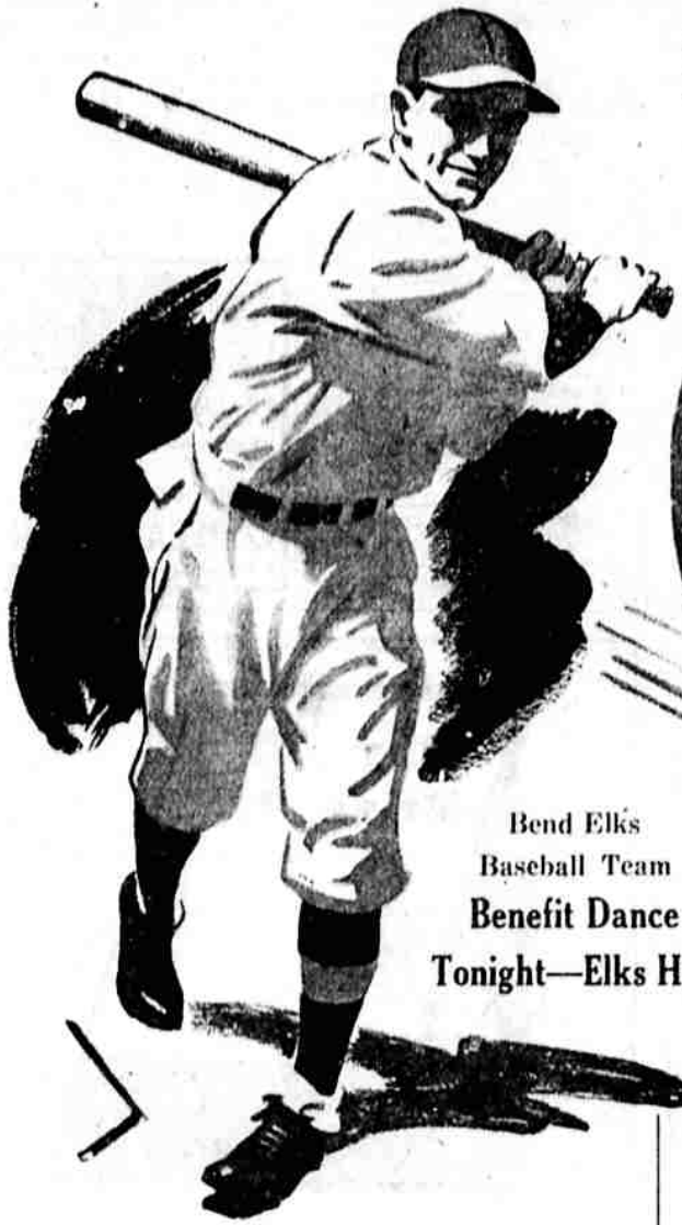
Bend Elks Baseball Team Benefit Dance Tonight—Elks Hall