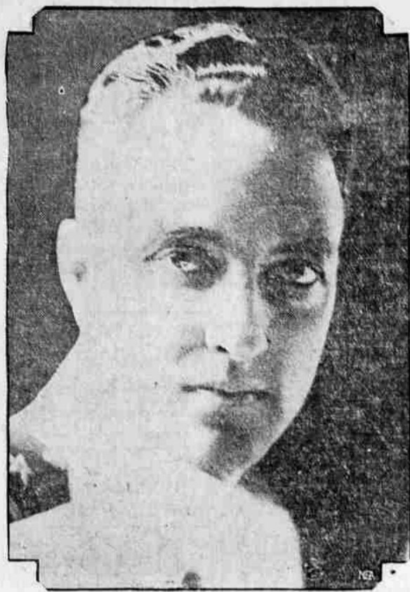
Home from France with honors comparable to those showered on Lindbergh is Commander Richard E. Byrd, intrepid scientist of the air. This splendid NEA Service photo shows Byrd in his best bib and tucker for the gala welcome that awaited him and his comrades of trans-Atlantic adventure in New York.

question. But, the demigod who has fallen cannot expect to regain the confidence of his former worshippers.