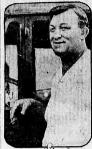
Here's Jim Flynn, prosperous taxi-cab owner in Phoenix, Ariz., and only man ever to knock out Jack Dempsey, who says that he's going east to see Jack Dempsey fight Gene Tunney. In other words, Flynn picks Sharkey as the loser in the Dempsey-Sharkey fight.