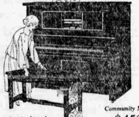
Community Model $450

Electric Reproducing Models $770—$855—$940