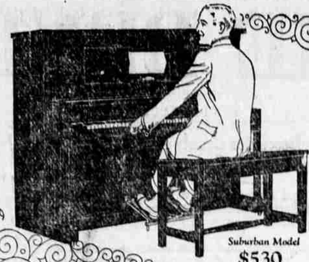
Suburban Model $530