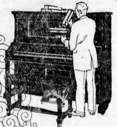
Country Seat Model $615